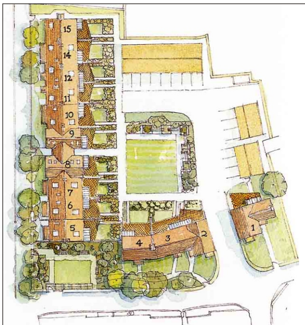
This page : site plans, maps & supporting sketches